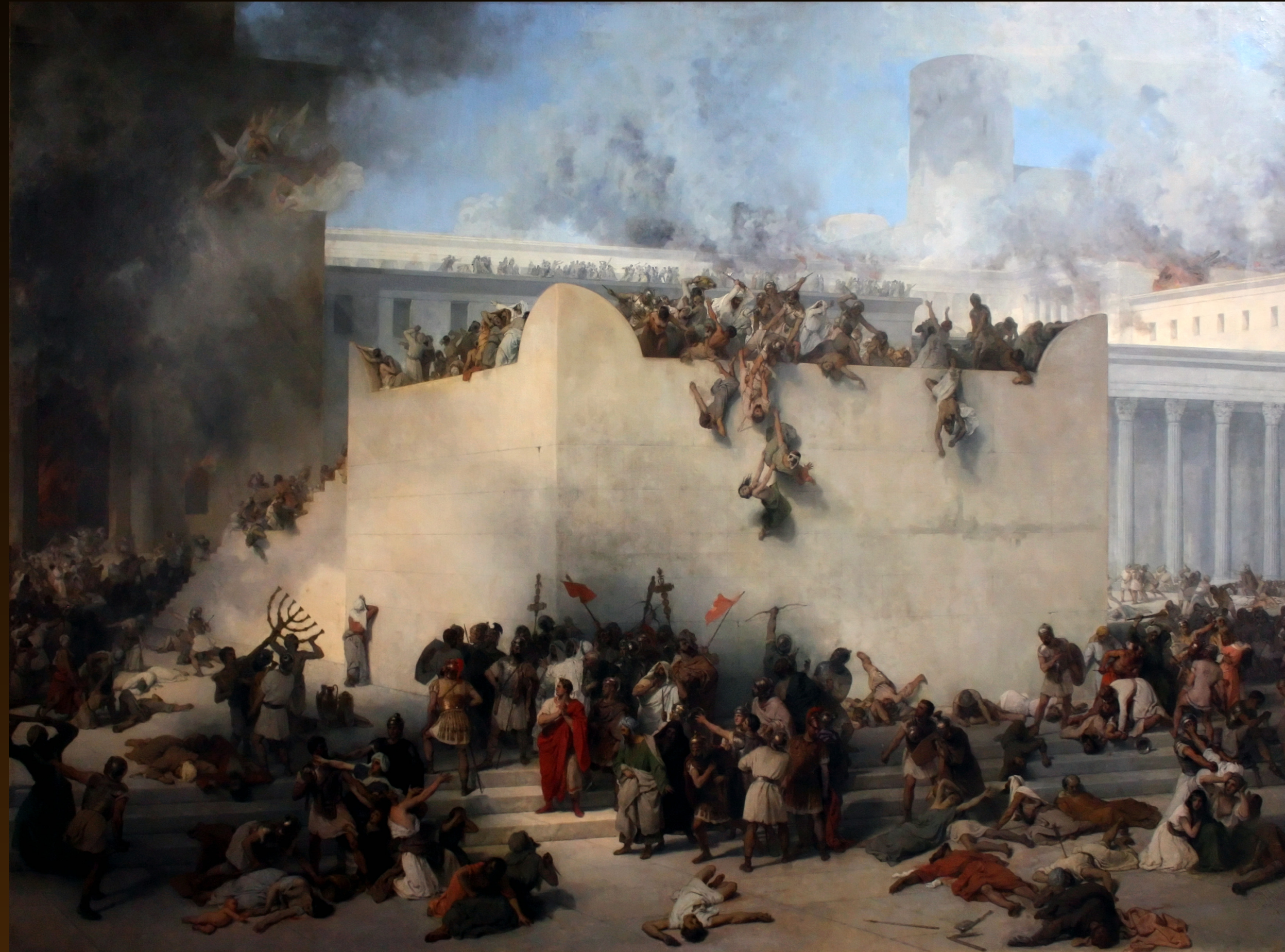
Destruction of the Temple in Jerusalem (AD 70) by Francesco Hayez (oil on canvas, 1867, Italy)