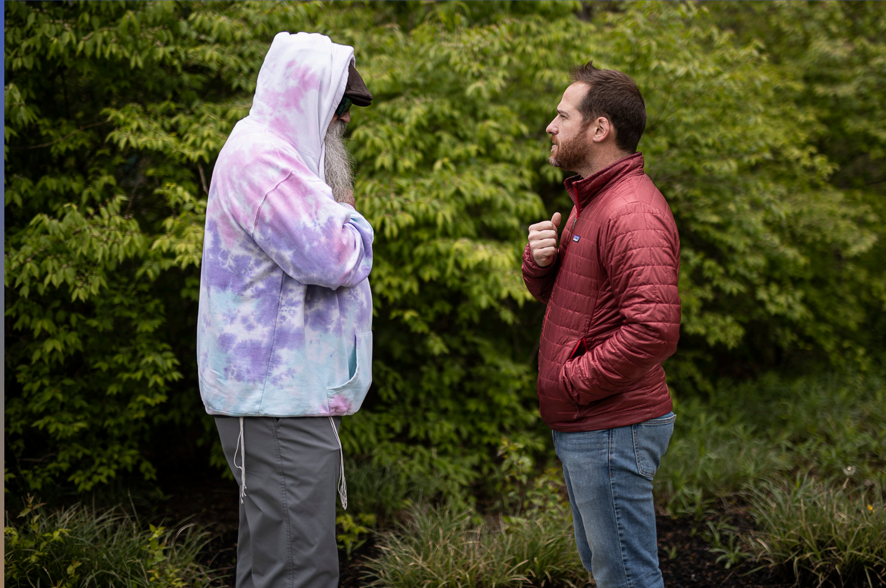
Prayer Labyrinth, Second Presbyterian Church, Meridian Hills, Indiana