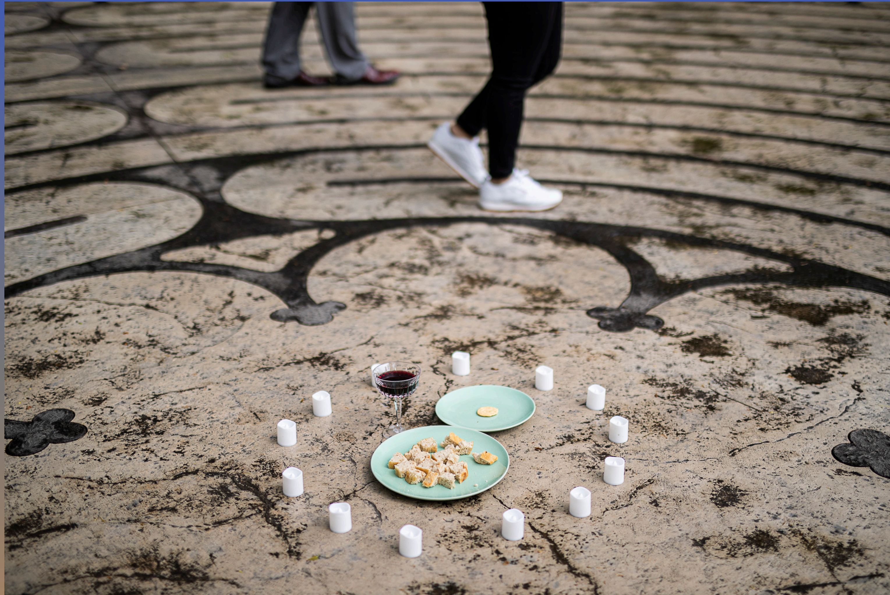
Prayer Labyrinth, Second Presbyterian Church, Meridian Hills, Indiana