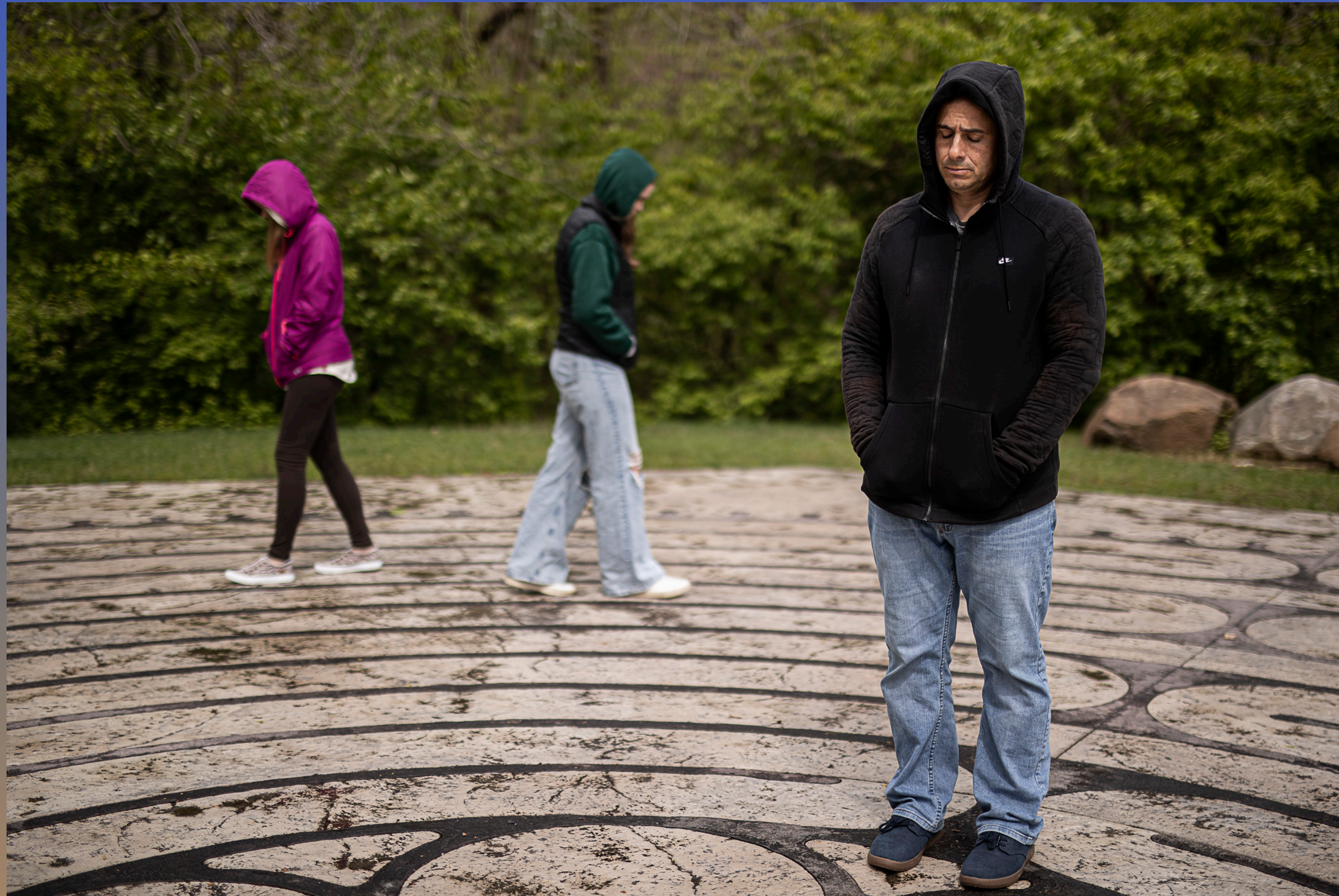
Prayer Labyrinth, Second Presbyterian Church, Meridian Hills, Indiana